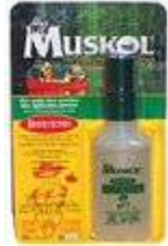
50 ml Pump Spray

Mosquito Coil Muskol Liquid 40 mL Muskol Liquid Pump 50 mL