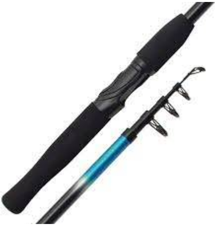
Spinning Length 6'

Please inquire about other rod lengths and line weights.