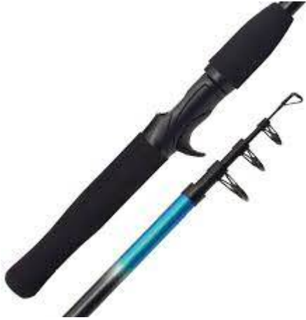
Spincast Length 6'